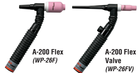
A-200 Flex (WP-26F)