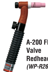
A-200 Flex Valve Redhead (WP-R26FV)

Note: Torches delivered may vary slightly from images shown.