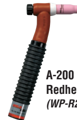
A-200 Flex Redhead (WP-R26F)