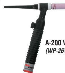
A-200 Valve (WP-26V)